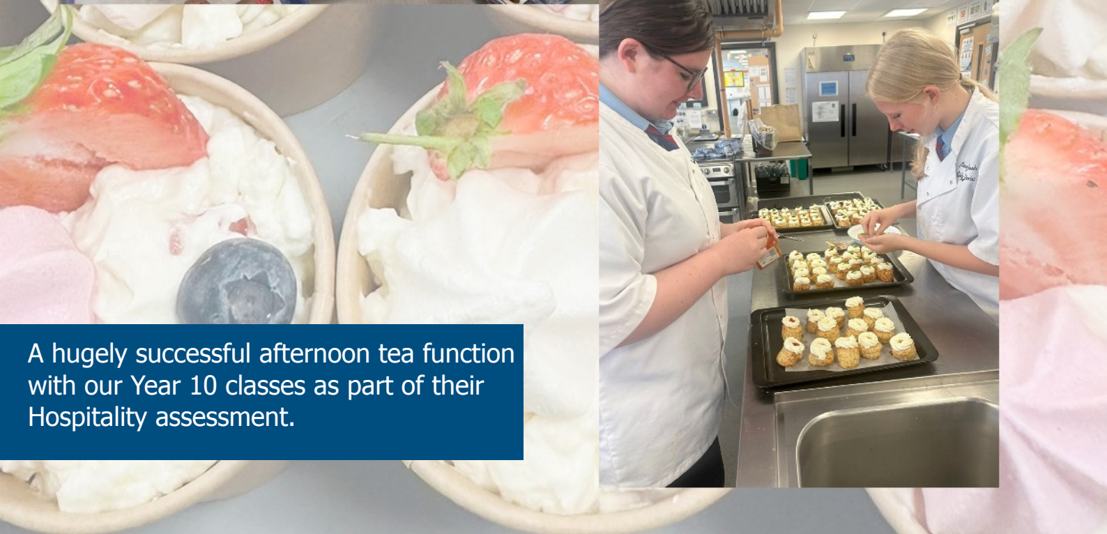
A hugely successful afternoon tea function with our Year 10 classes as part of their Hospitality assessment.