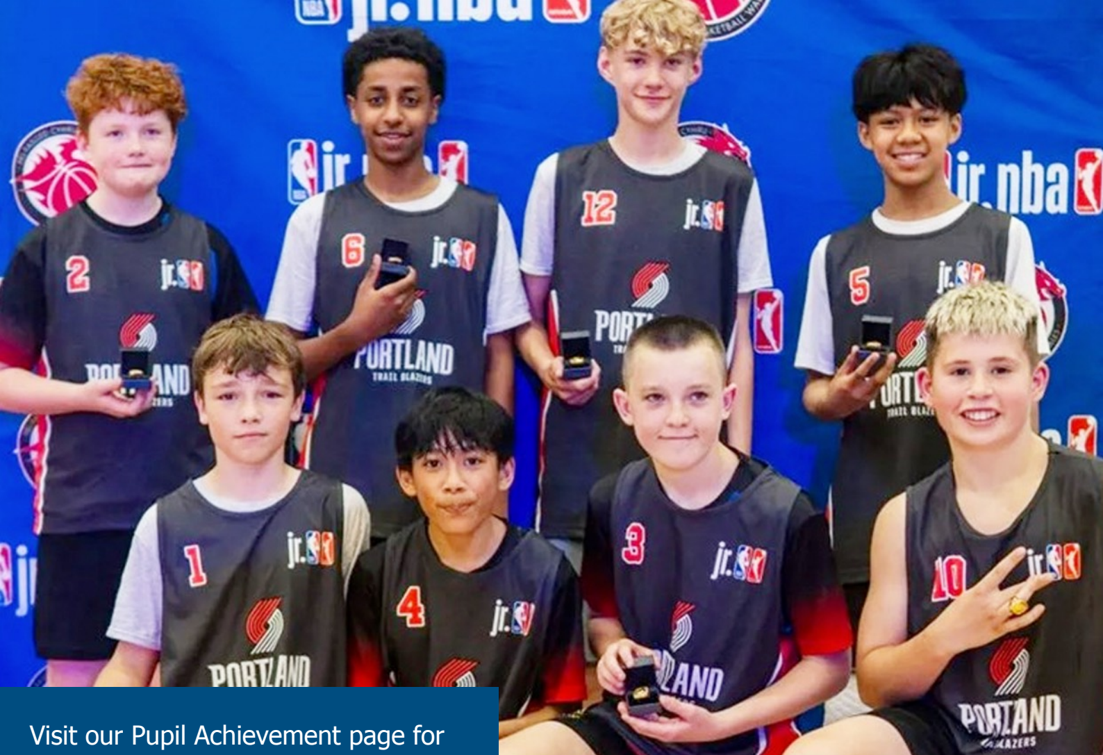
Visit our Pupil Achievement page for up to date achievement stories.