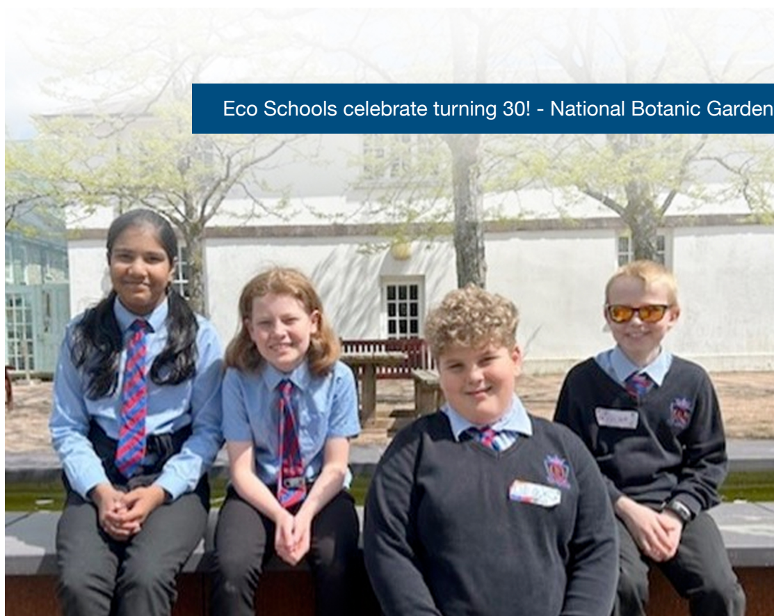
Eco Schools celebrate turning 30! - National Botanic Gardens of Wales

As explained previously, the misuse and constant use of mobile phones present some significant wellbeing and wider mental health risks to our community, as well as presenting a distraction to learning. Following a successful pilot scheme we have moved to a ban on mobile phones in school. While pupils can bring phones to school, they should be turned off and placed in their bags. Pupils who fail to abide by these rules and do not use their phones responsibly can expect to have their phones confiscated. Phones can only be returned to parents once confiscated.